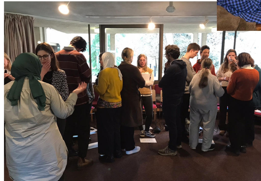
Left: delegates at the OxPeace training for peacebuilding students, academics, and practitioners speak with RCF staff during values-based training.