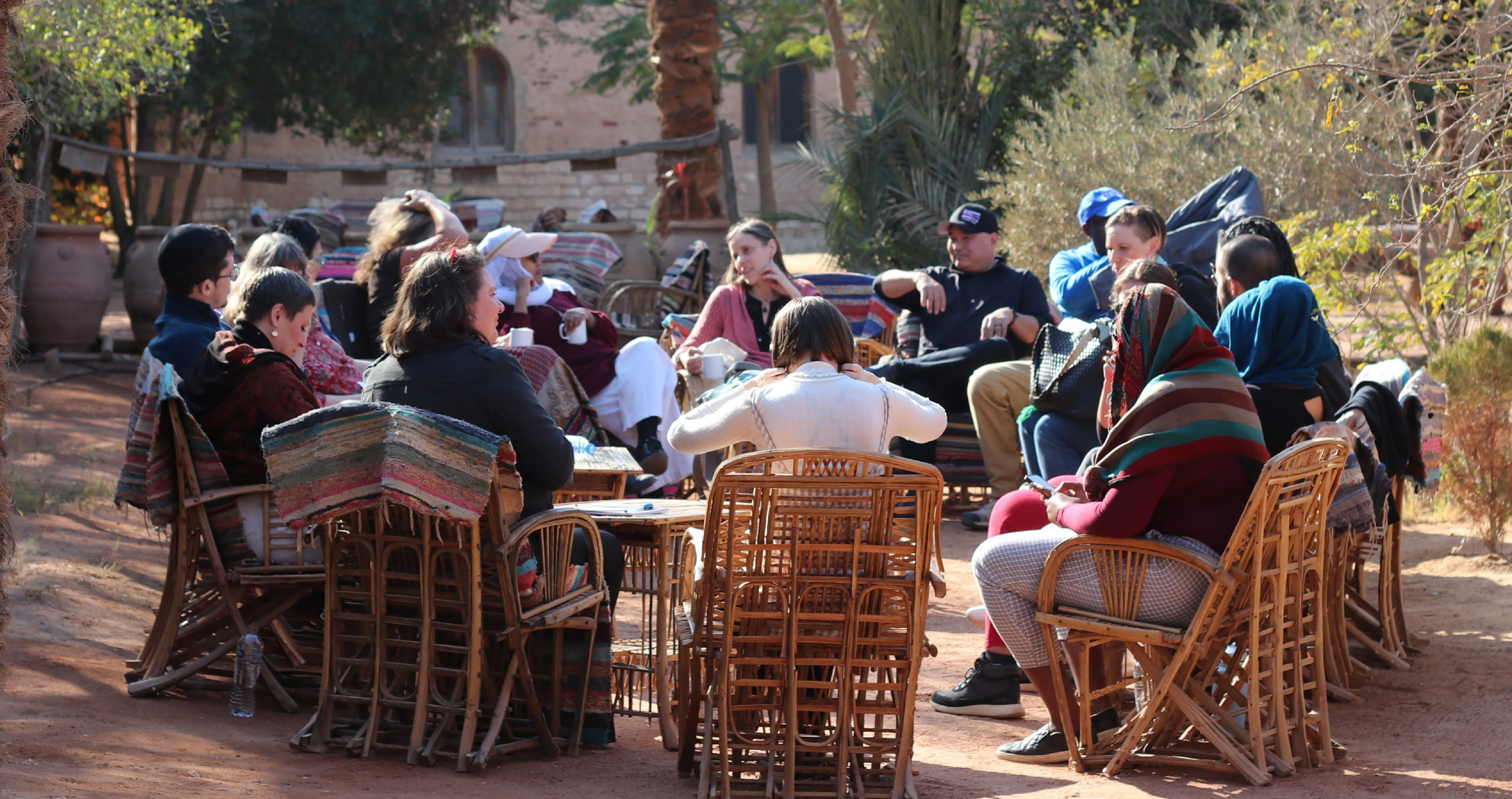
Participants in the Odyssey Fellows Encounter Programme gather outside for a facilitated discussion at Anafora, Egipt