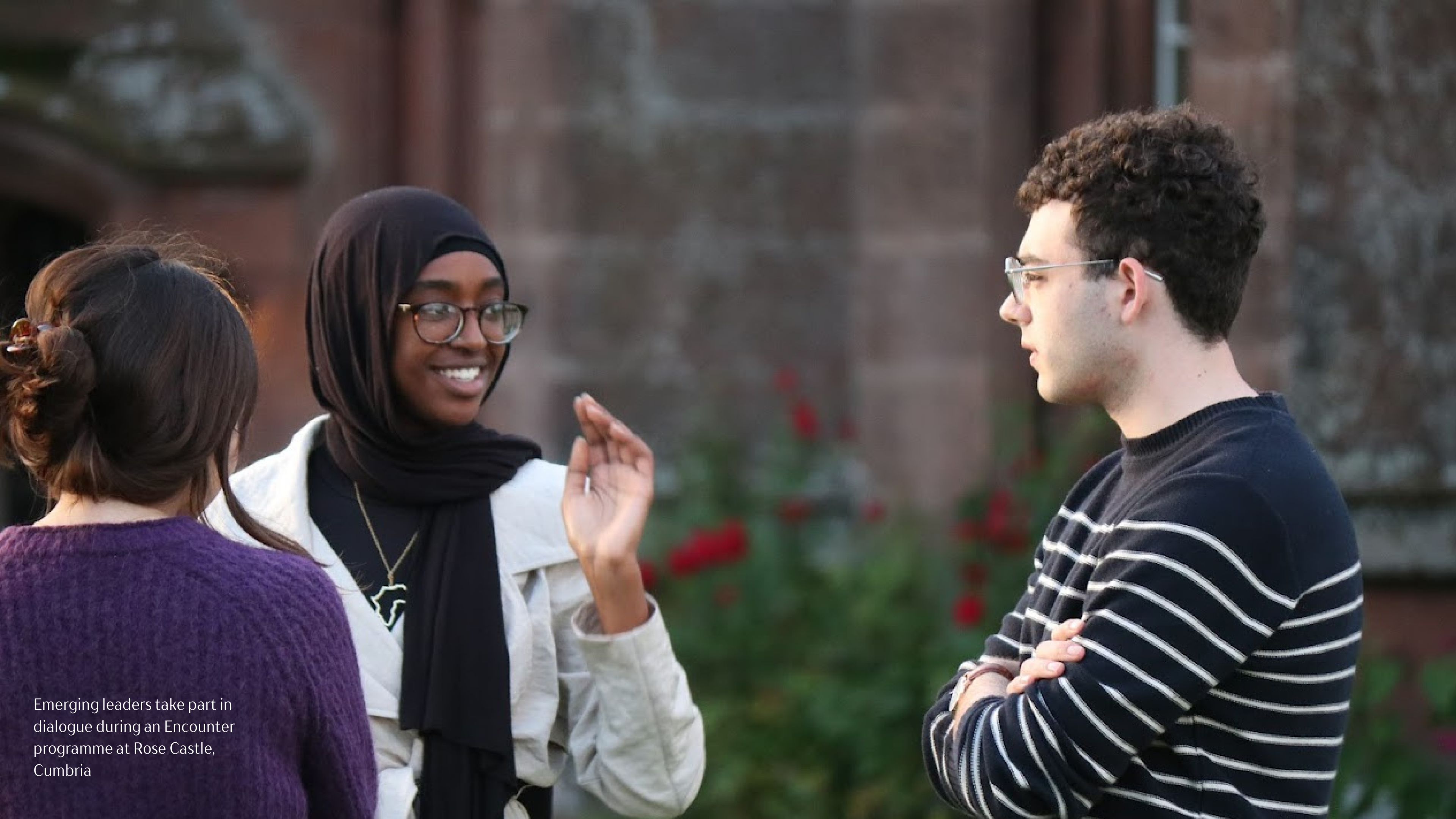
Emerging leaders take part in dialogue during an Encounter programme at Rose Castle, Cumbria